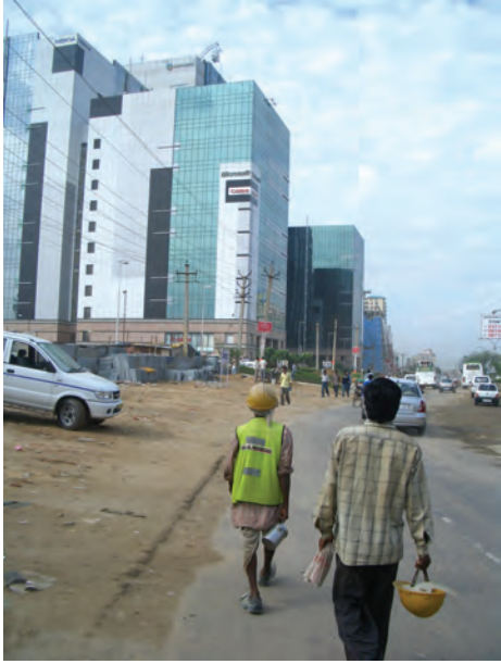
Accidents are common to construction sites. Yet, very often, safety equipment and other precautions are ignored.