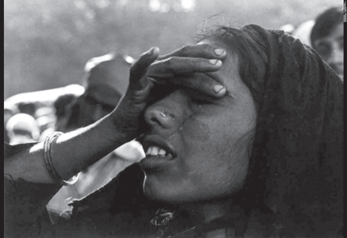
The next morning