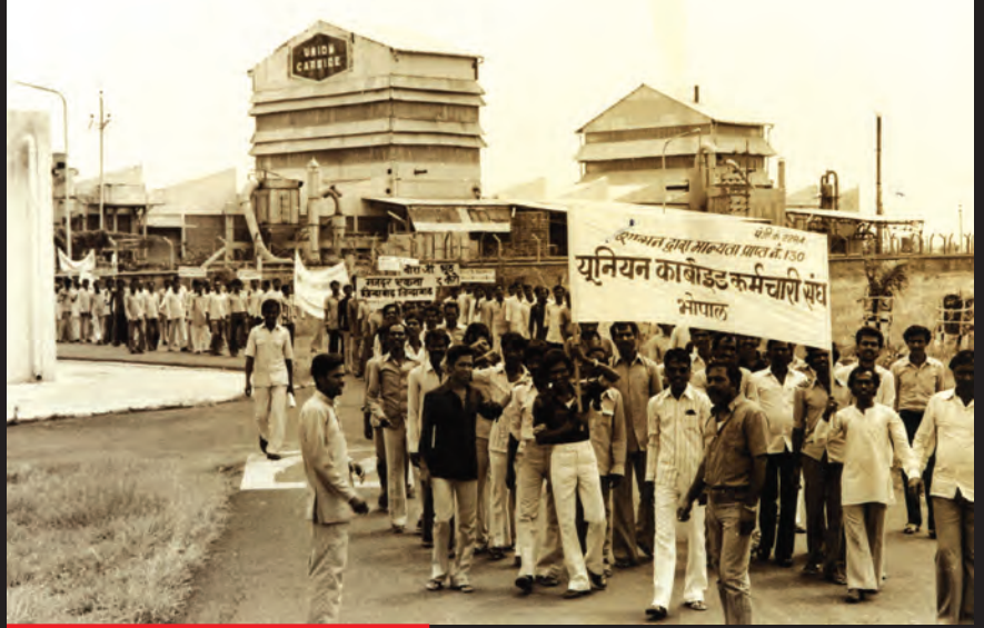
Members of UC Employees Union protesting

The disaster was not an accident. UC had deliberately ignored the essential safety measures in order to cut costs. Much before the Bhopal disaster, there had been incidents of gas leak killing a worker and injuring several.