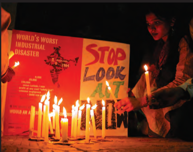
The struggle for justice goes on...

24 years later, people are still fighting for justice: for safe drinking water, for health-care facilities and jobs for the people poisoned by UC. They also demand that Anderson, the UC chairman who faces criminal charges, be prosecuted.