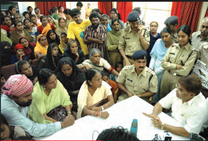
Gas victims with the Gas Relief Minister

Despite the overwhelming evidence pointing to UC as responsible for the disaster, it refused to accept responsibility.