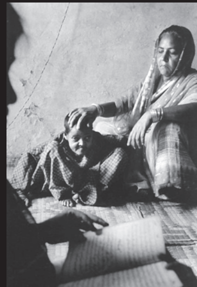
A child severely affected by the gas

Most of those exposed to the poison gas came from poor, working-class families, of which nearly 50,000 people are today too sick to work. Among those who survived, many developed severe respiratory disorders, eye problems and other disorders. Children developed peculiar abnormalities, like the girl in the photo.