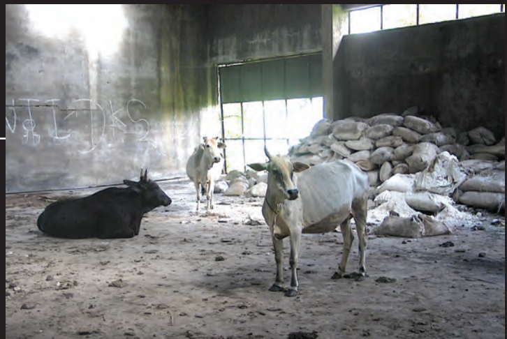
Bags of chemicals lie strewn around the UC plant

UC stopped its operations, but left behind tons of toxic chemicals. These have seeped into the ground, contaminating water. Dow Chemical, the company who now owns the plant, refuses to take responsibility for clean up.